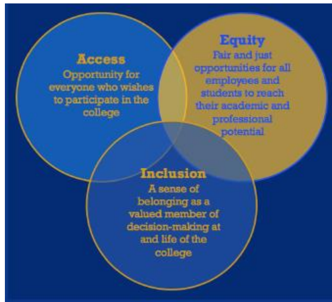
Lane’s Equity Lens Framework

These recommendations support the importance of Lane’s Equity Lens in improving governance through improving access, equity, and inclusion.