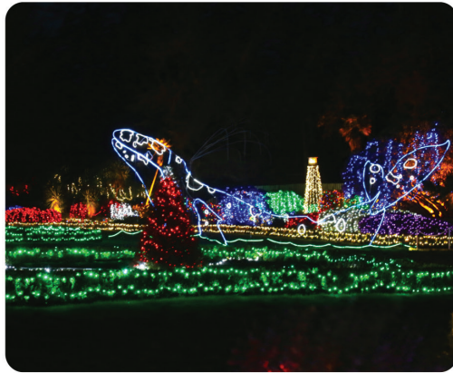
Shore Acres LCC Retiree's Bus Trip in December, 2015