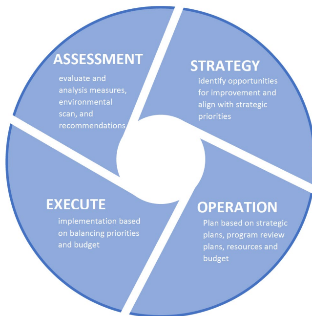
Figure 1: Strategic Planning and Resource Allocation Cycle

Strategic Directions and a Strategic Plan are established every five years to identify priority actions needed to support student learning and success, as measured by verifiable institutional indicators. Strategic Priorities are established to identify priority areas of focus based upon assessment of progress toward Strategic Directions, objectives and outcomes, and internal and external environmental scanning. Program Review and Department Planning support Strategic Directions and priorities by operationalizing priorities and improvements at the program and service level. The College has recently transitioned to the 2022–2027 Strategic Plan. The Strategic Plan Steering Committee was composed of College stakeholders, including faculty, classified staff, students, and administrators.